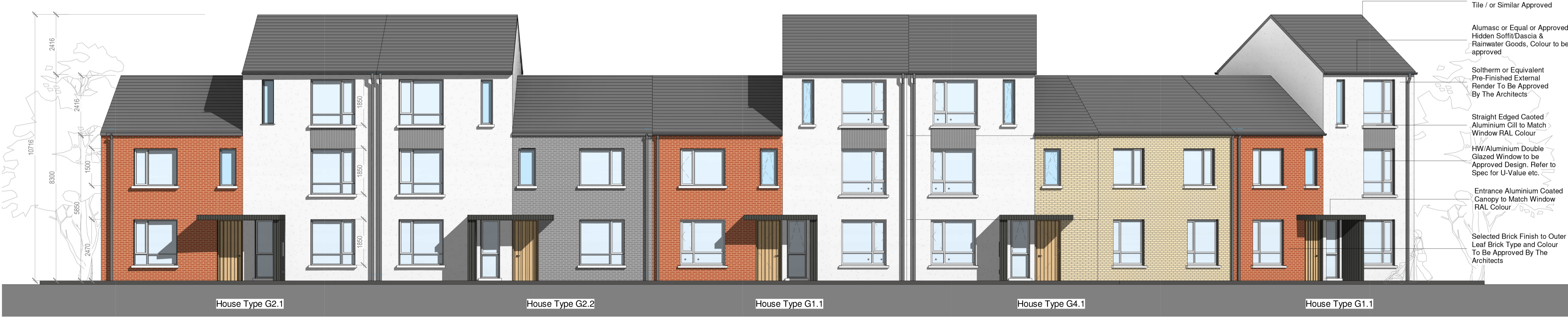
3 Block 16-G1- Front Elevation 1:100

HOUSE TYPE G1.1, G1.2 3 BEDROOM / 6 PERSON FLOOR AREA 128.6 M2 / 1384.3 SQFT